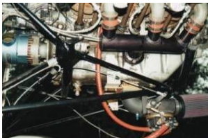
Continental O-300-D lower side