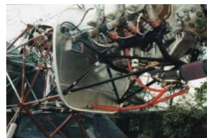
Continental O-300-D bottom & frame