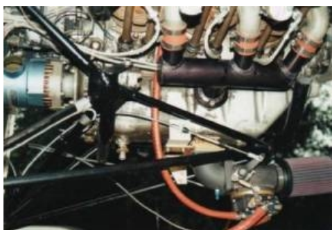
Continental O-300-D lower side