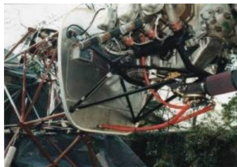
Continental O-300-D bottom & frame