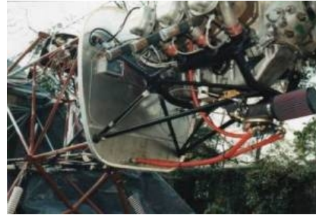
Continental O-300-D bottom & frame