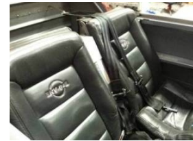
CLICK PHOTOS TO ENLARGE THEM