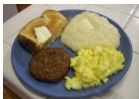
Please bring side dishes for breakfast!

Now get those planes out and get them ready for the fly-ins this month! Hope to see you all at our local events!