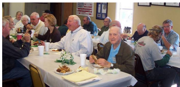
Many members and guests enjoyed the fish fry.