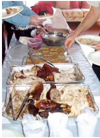
There was plenty of turkey and trimmings.