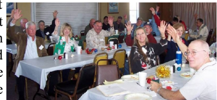
Members voting for the club officers.