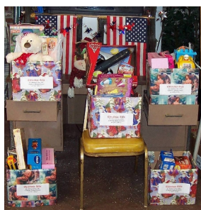
Gifts for the MCG children.