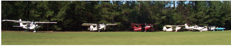
Part of the fly-in flightline.

It was a perfect day for a fly-in, sunny, warm, hardly any wind. Numerous members and